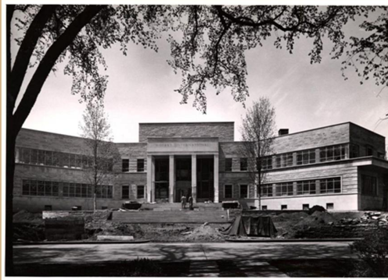
The world headquarters on Ridge Avenue in Evanston, Illinois, USA, near the end of construction in 1954.