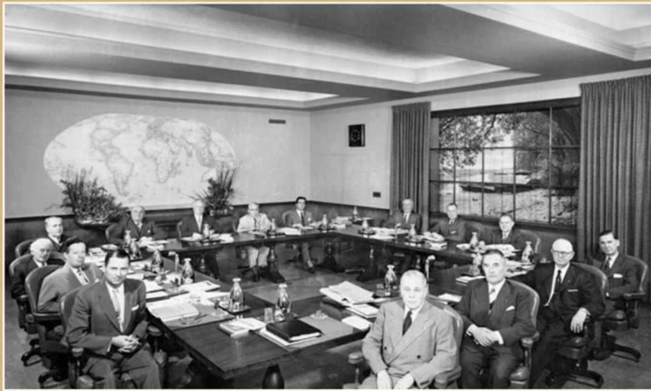
The boardroom at the world headquarters on Ridge Avenue, Evanston, Illinois, USA. The room was located in the center of the building and what looked like windows were actually large scenic murals. 1955.